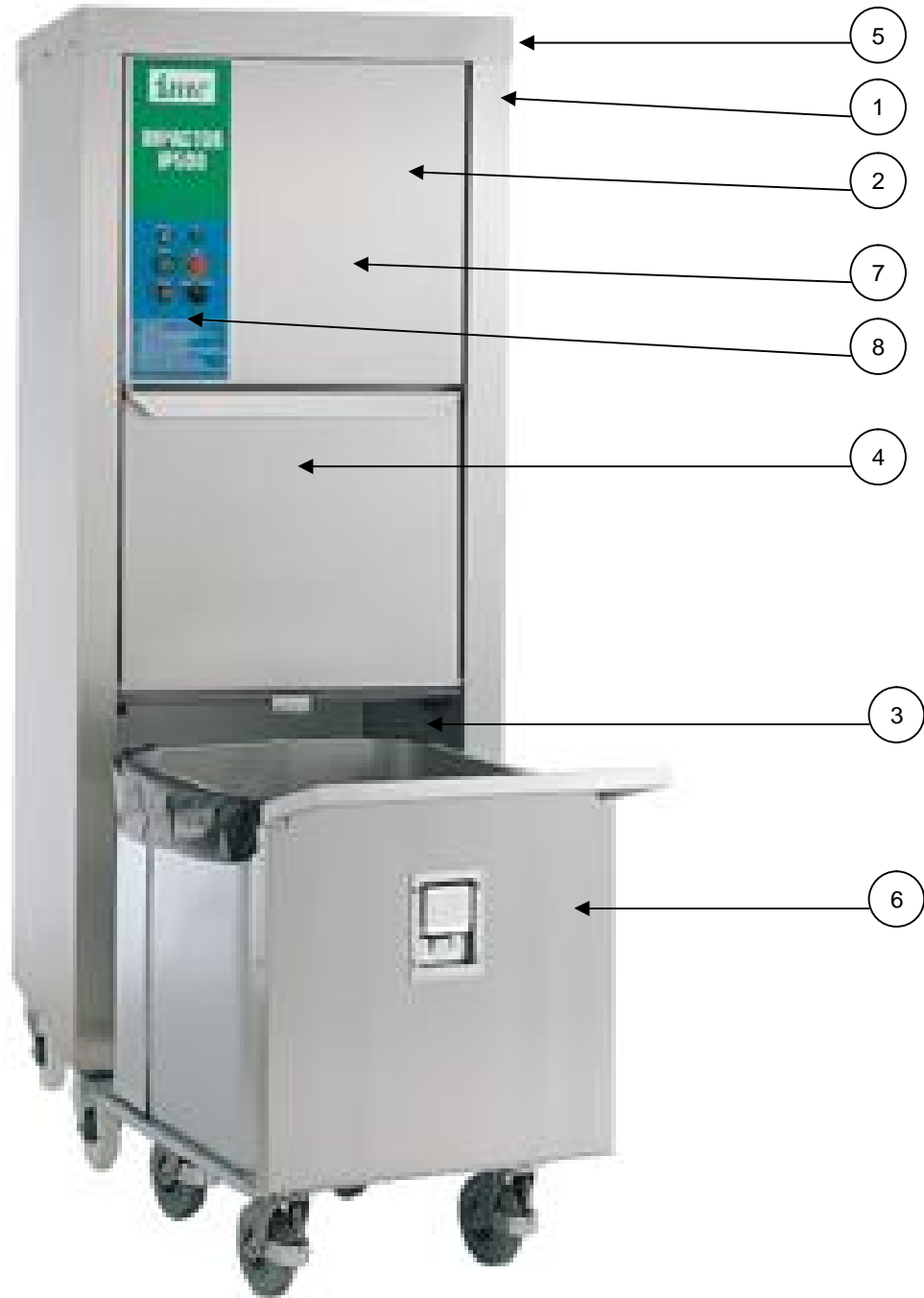
Parts Illustration – IP500 Fig.3