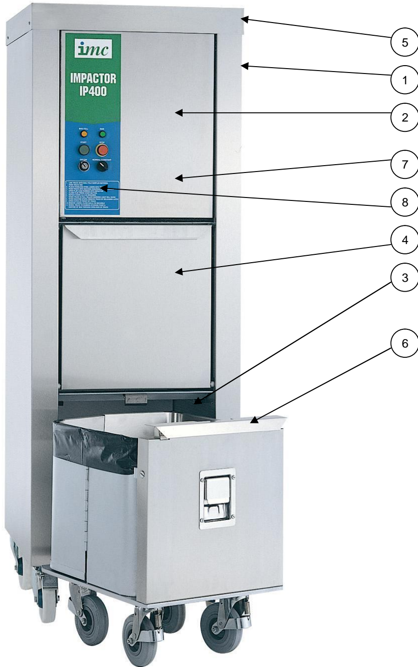
Parts Illustration – IP400 Fig.2