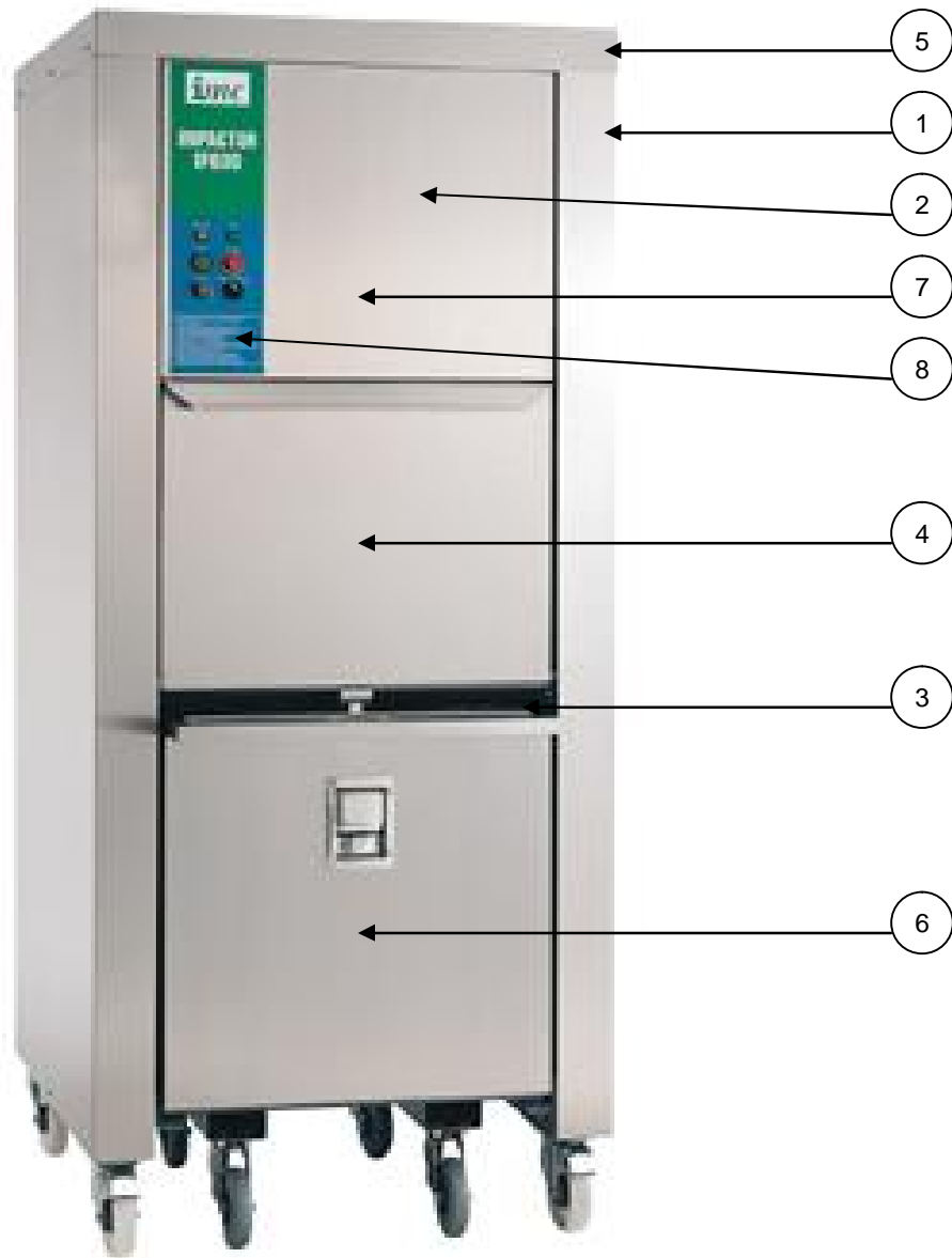
Parts Illustration – IP600 Fig. 4