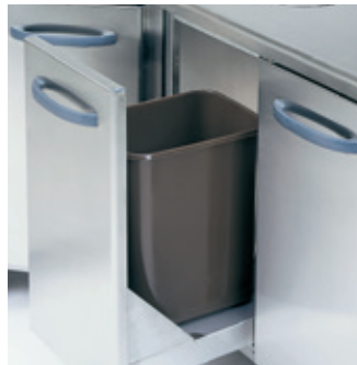
Proff fixtures offer many practical details and numerous combination possibilities with refrigerated and heated Proff units.