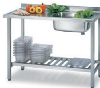
Wash table 1200, code 4180440