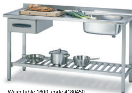
Wash table 1600, code 4180450