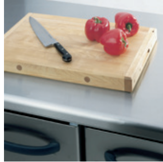
The seamless counter top is tailor-made to match your need. Below the top there is a stainless support frame with efficient soundproofing.