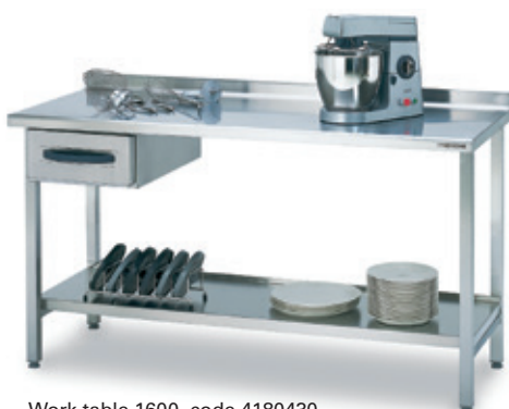
Work table 1600, code 4180430