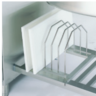
Cutting board rack.