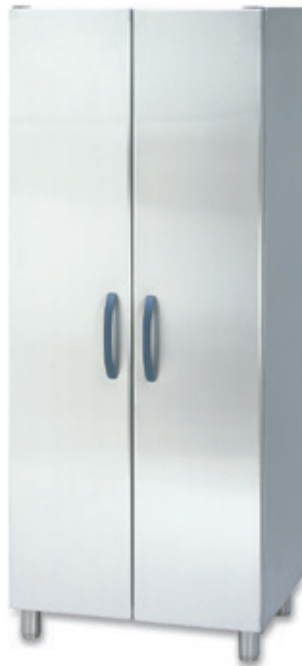
High cupboard FC-2