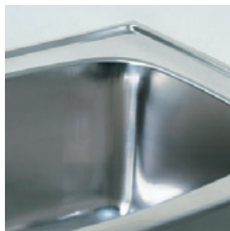
Wash basins and sinks with rounded edges.