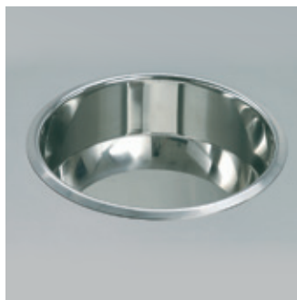
Round waste hole with collar.