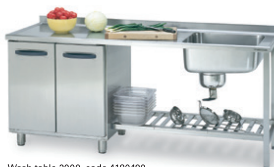
Wash table 2000, code 4180490