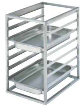
Rails for seven GN1/1-65 containers.