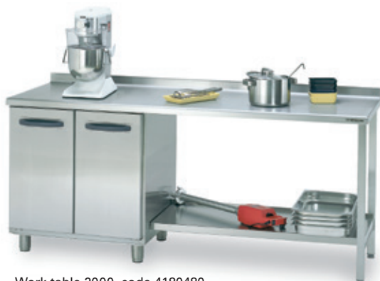
Work table 2000, code 4180480