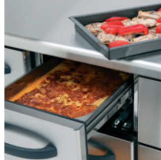
The telescopic runners enable the drawers to be pulled out entirely.