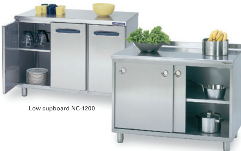
Low cupboard NC-1200