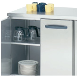
Cupboard 400 mm or 800 mm.

The standard height of the Proff tables is 900 mm, the adjustment range of the legs is + or - 25 mm. The adjustable threads of the pleasant round legs are totally hidden. The square legs are of 40x40 mm stainless steel tube. Proff fixtures are also available with a high base with 250 mm lower space. The standard splash guard in wash tables is 60 mm high. As an option, a 60-200 mm high splash guard is available.