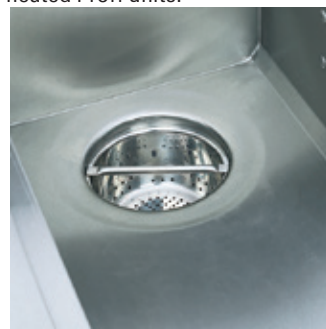
Strainer basket, rounded construction easy to clean.