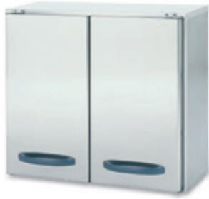
Wall cupboard HCB-2

Proff standard units include the work tops and standard elements described on these pages. The standard counter top depth is 650 mm. You can also design table units to suit your specific need using the Proff elements.