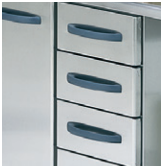
All drawers are fitted with frame for GN containers (containers not included).