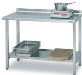
Work table 1200, code 4180420